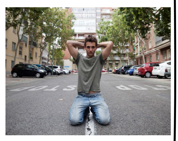
Or click on the following link:

https://www.youtube.com/watch?time_continue=4&v=V3qXCDkSmrl&feature=emb_logo