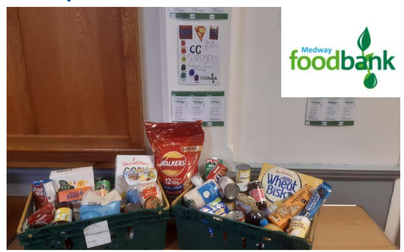
During Term 1, students and staff were invited to donate nonperishable food to Medway Foodbank.

Medway Foodbank is a project founded by local churches and community groups, working together towards stopping hunger in our local area and providing emergency food to people in crisis.